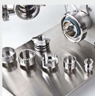
Flexible use of different rotor / stator configurations and sizes