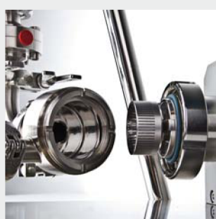
Standard high-polished tool components