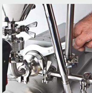
Easy cleaning and maintenance

Connections: Motor connection: 6-pin lead-out terminal USB connection: yes Power supply: On-/off switch on front Controls: LCD status display for displaying operational data such as: parameter, speed setpoint / actual, load indicator, active drive, error messages LED status indicator: Ready, active load detector, keypad for operation, drive selection and parameterization