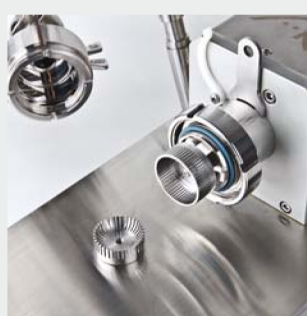
Quick tool change