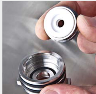
Revolutionary sealing system in cartridge construction allows quick and easy replacement of the sealing lips